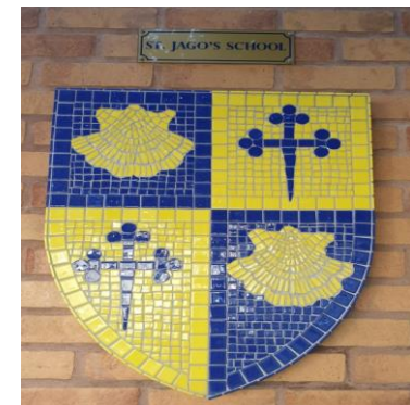
ST JAGO'S YELLOWS