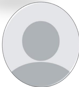
Head of Year 8 - Pending