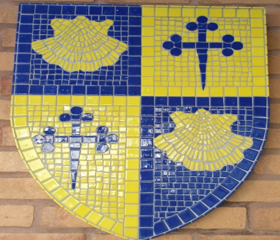
ST. JAGO'S SCHOOL